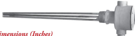
E2 — Dimensions (Inches)