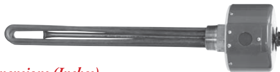
E1 — Dimensions (Inches)