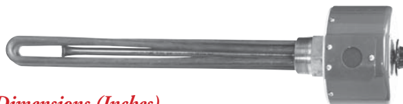
E1 — Dimensions (Inches)