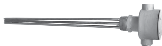
E2 — Dimensions (Inches)