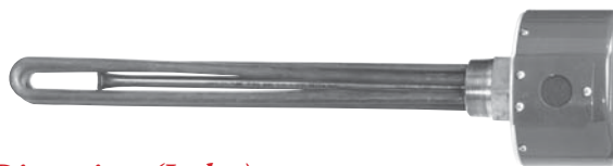
E1 — Dimensions (Inches)