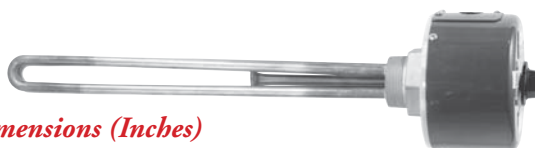
E1 — Dimensions (Inches)