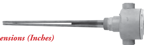
E2 — Dimensions (Inches)