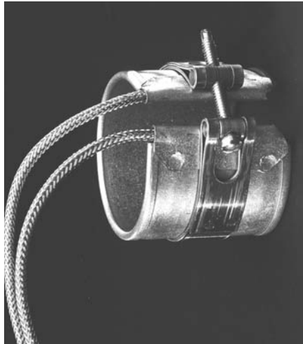
HV Nozzle with A Lead