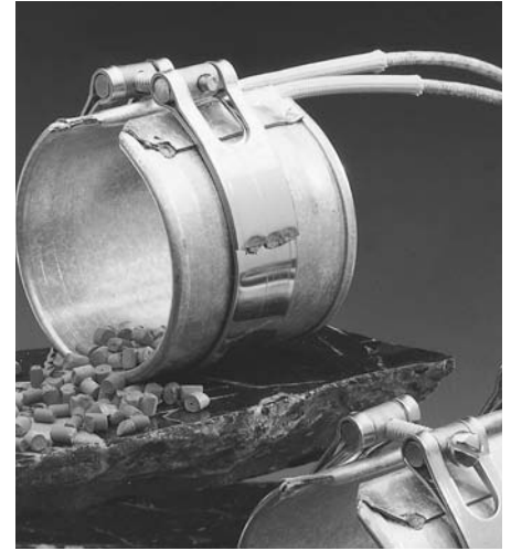
HV Nozzle with L Lead